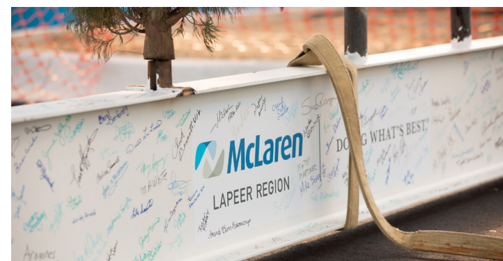
2019 groundbreaking (left), Signed beam (bottom right).

The medical office building houses the offices of physicians from a variety of specialties, including orthopedics; otolaryngology; physical, occupational and speech therapy; neurosurgery; obstetrics and gynecology; pediatrics; family practice; internal medicine; gastroenterology; and general surgery. The building also houses laboratory services and diagnostic imaging.